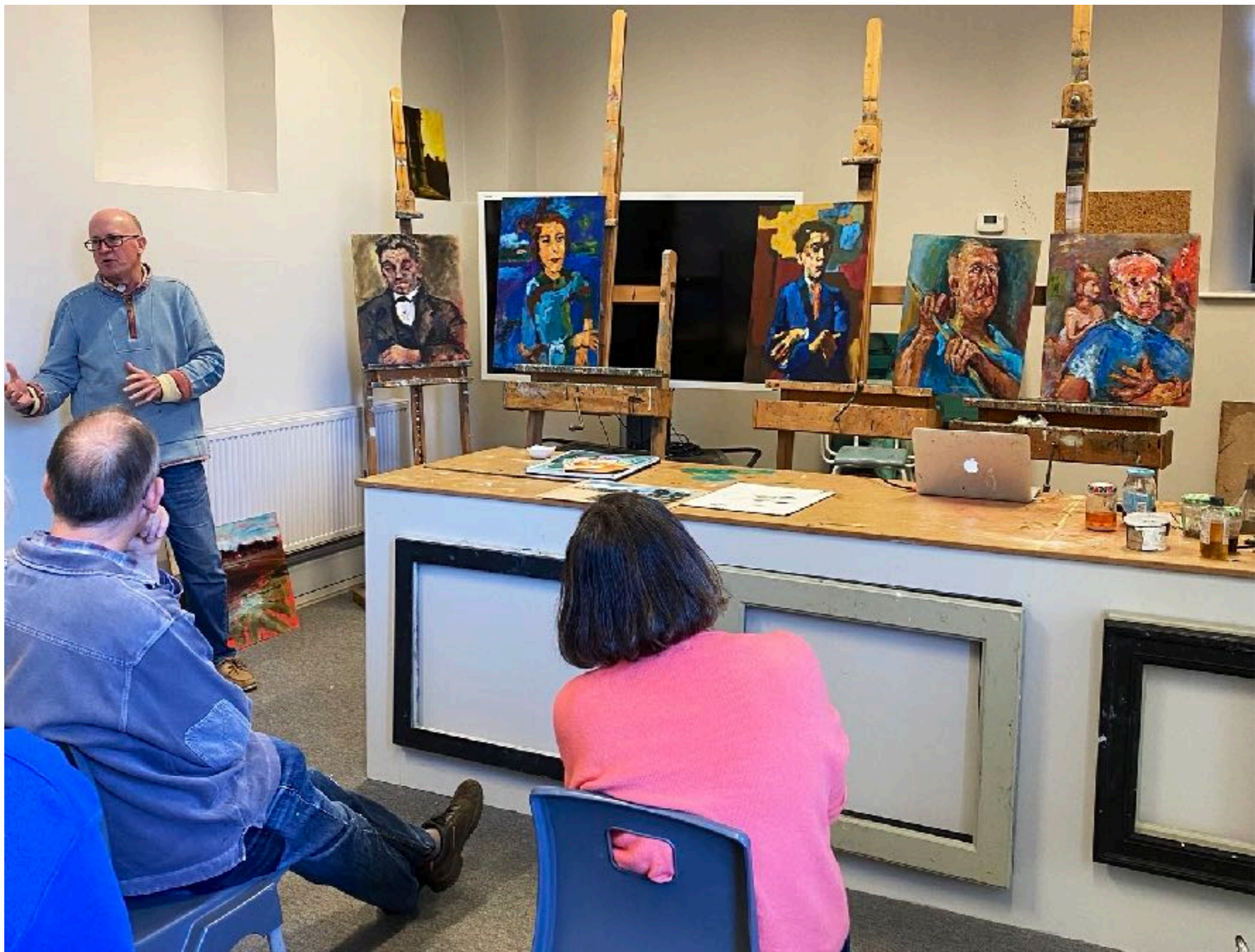
Experimentation and presentation lies at the heart of the Diploma learning experience. Current student B.W. workshop 10.