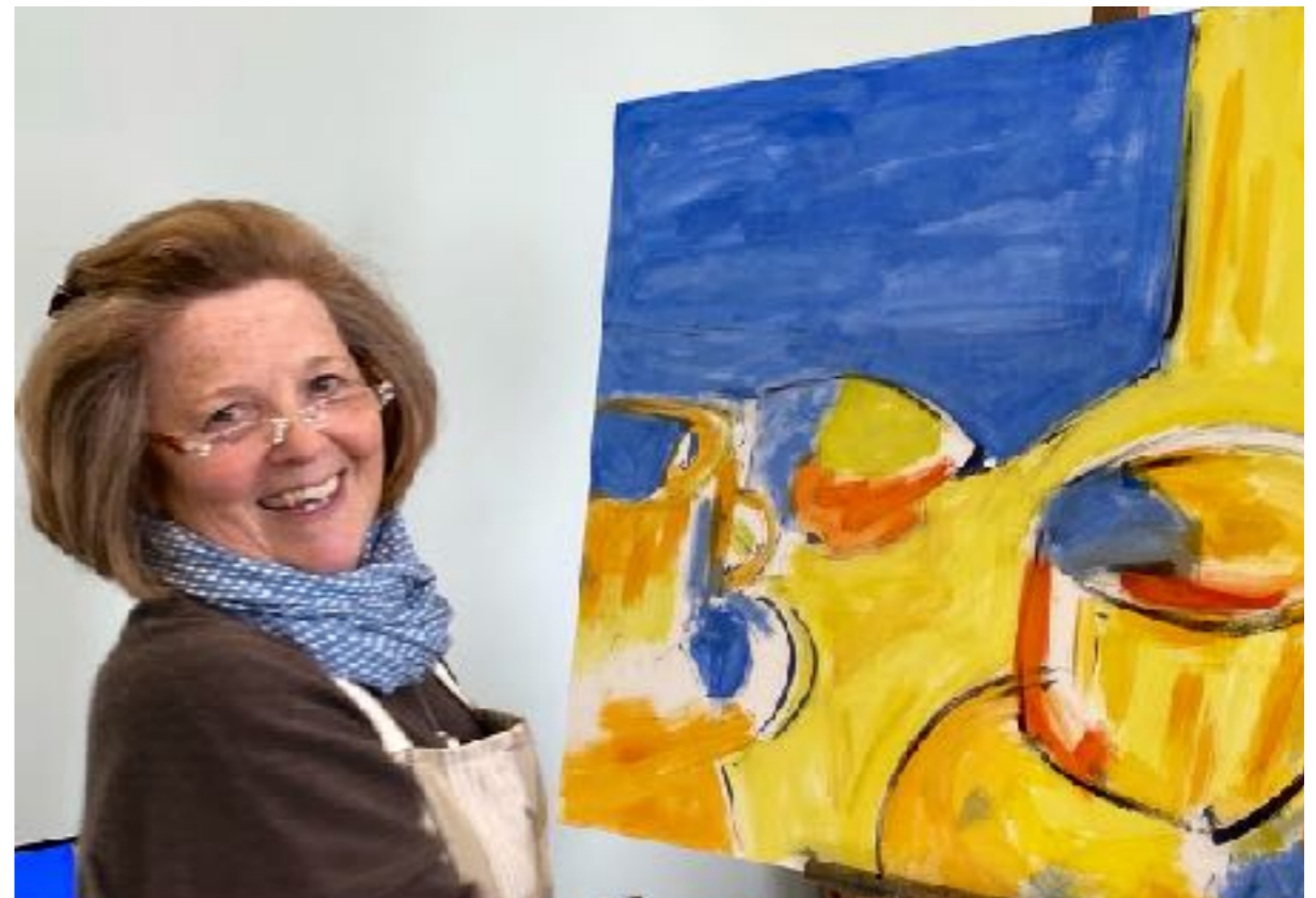
2023 cohort Diploma students presenting their ongoing personal projects, from full size Hay Wains to Kokoschka inspired portraiture skills.